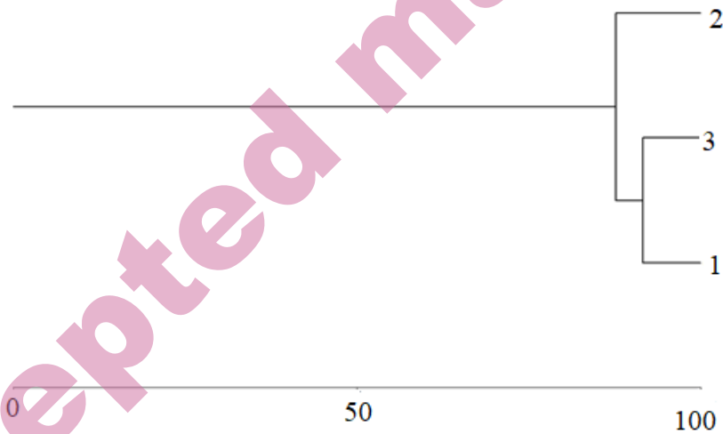
Fig. 2. Bray-Curtis Similarity Dendrogram of Stations

This dendrogram summarizes the similarity of physicochemical data between the stations based on Bray-Curtis Similarity analysis. The first and third stations showed the highest similarity (91.60 %), while the second station had a lower similarity to the other two stations (82.35 %). The Bray-Curtis similarity dendrogram for the stations is presented in Fig. 2.