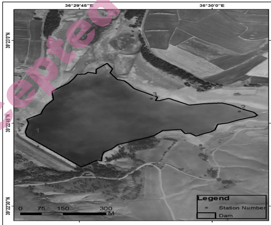
Fig. 1 Maksutlu Dam Lake and sampling locations

The map of the study area and sampling locations is given in Fig. 1.